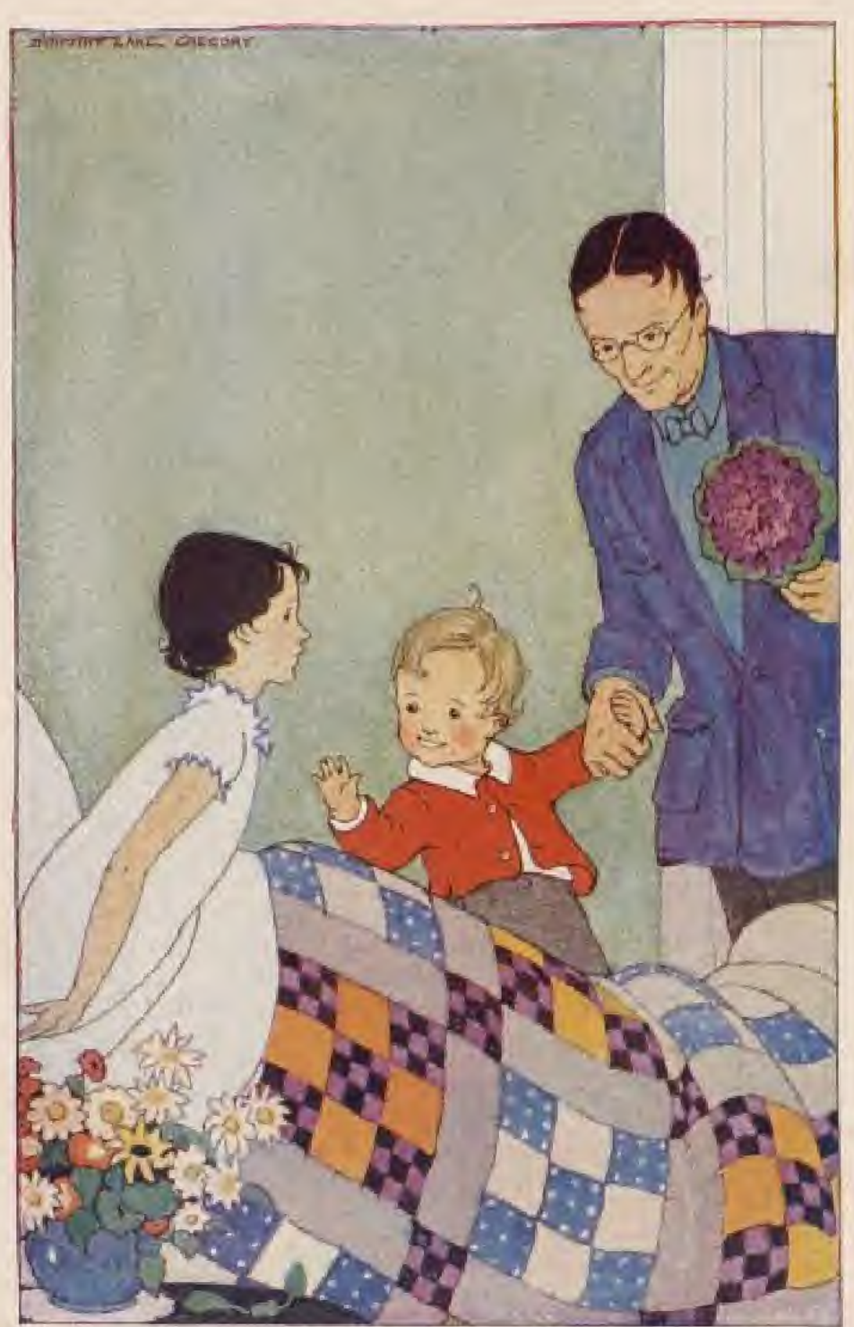
One day the stranger was allowed to see Violet